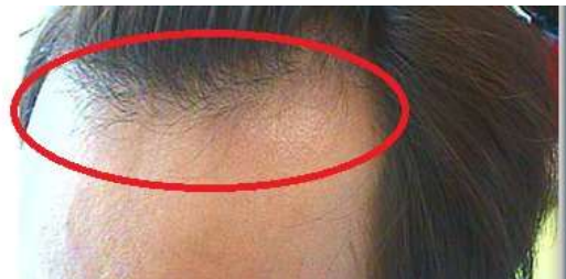
4 th treatment