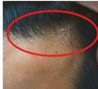
3 rd treatment