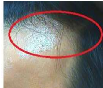
9 th treatment