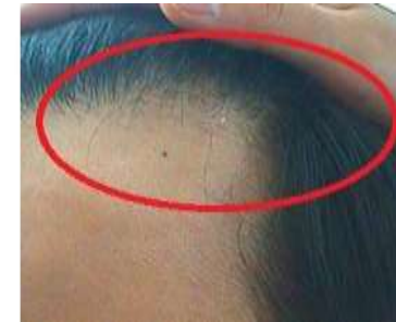
12 th treatment