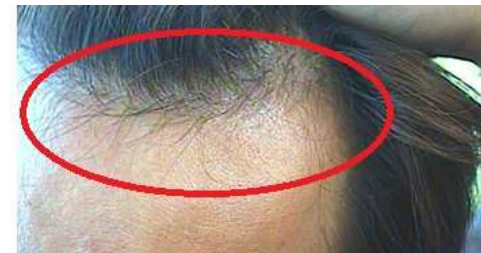
10 th treatment